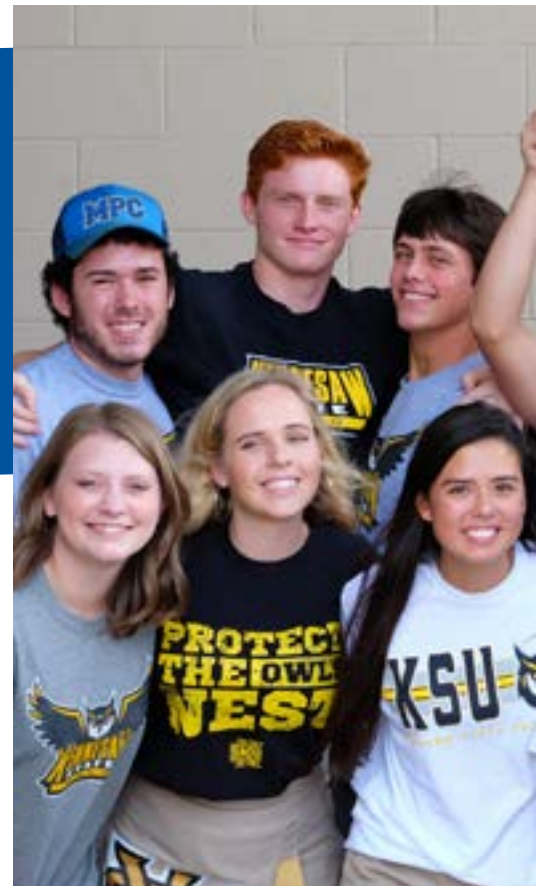
MPCS graduates heading to KSU.

Kennesaw State is a favorite choice because the school is listed among the nation's top national universities by U.S. News. As one of Georgia's most innovative institutions in teaching and learning, KSU offers undergraduate, graduate and doctoral degrees on two suburban campuses in Kennesaw and Marietta.